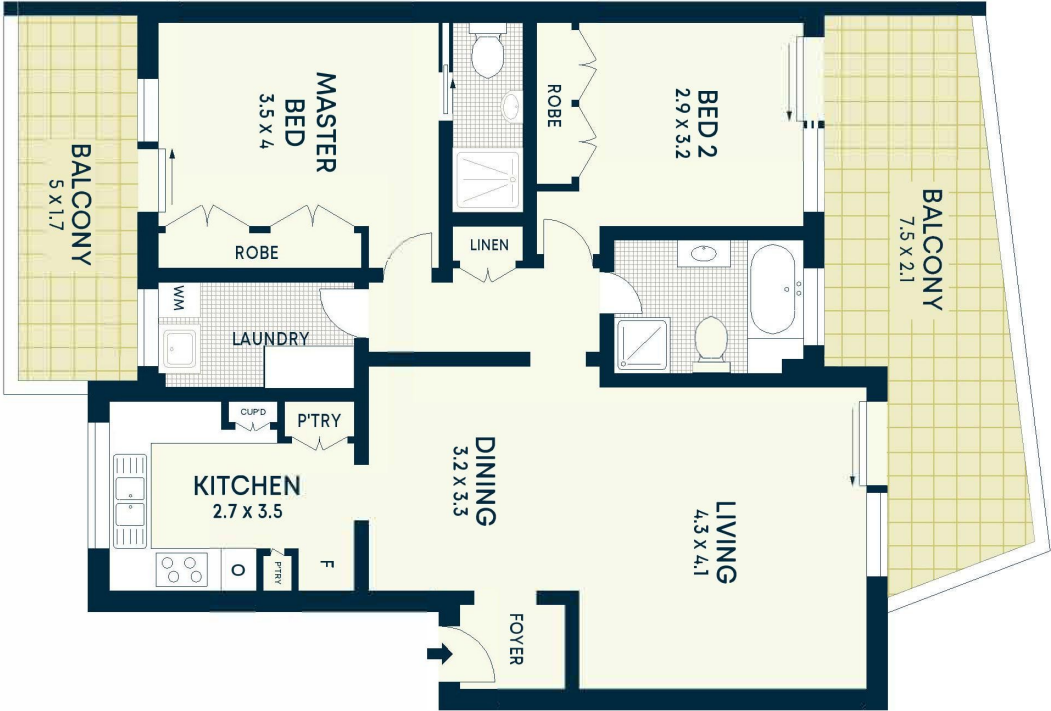
TOP FLOOR 89.3 sqm