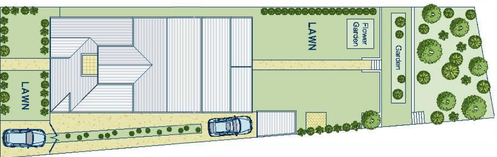
SITE PLAN Victoria Place