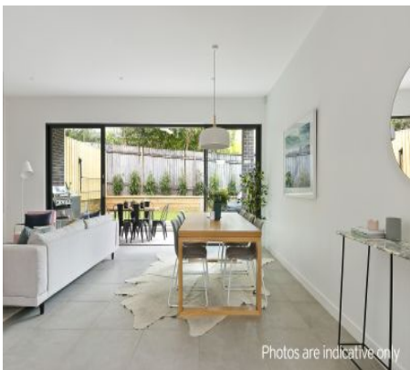
Photos are indicative only