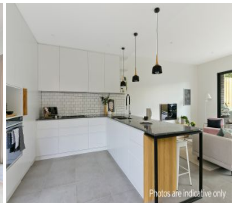
Photos are indicative only